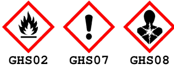
GHS02 GHS07 GHS08