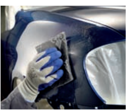
Matting of lacquer or metallic colour coats