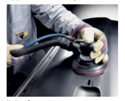
Keying of e-coats