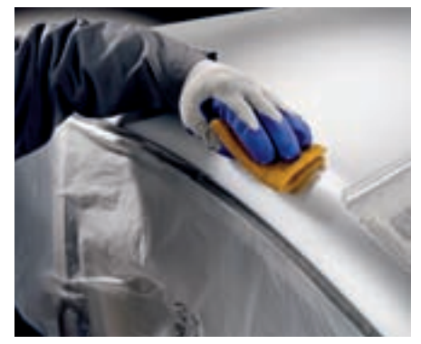
Matting of sensitive paint and lacquer